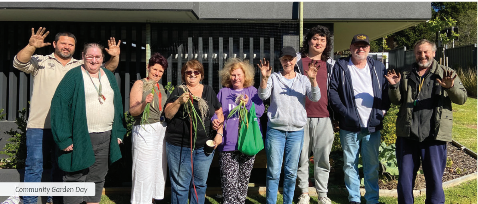
Community Garden Day